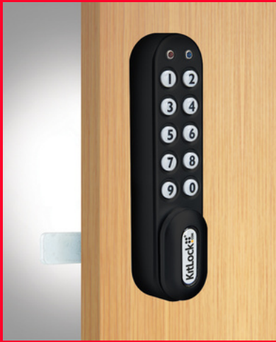
BLACK Electronic Smart Lock