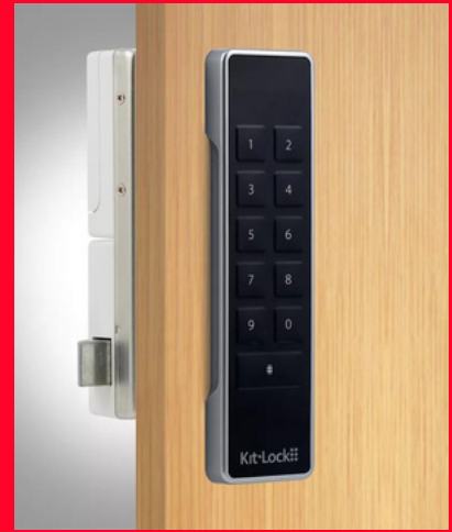
BLACK & SILVER Electronic Keypad Lock