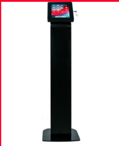
BLACK Digital Premium Locking Floor Stand Kiosk