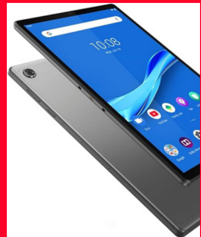
SILVER Lenovo Tab M10 or greater