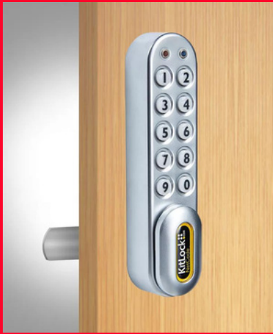
SILVER Electronic Smart Lock