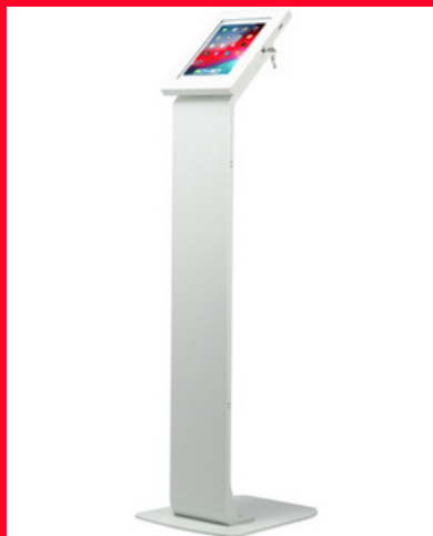
WHITE Digital Premium Locking Floor Stand Kiosk